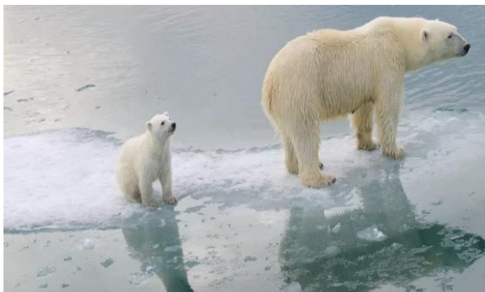
Figure 2. The photograph represents the global warming impact on polar bears 2 .

The Paris Agreement was a global decision undertaken to reduce climate change for future generations. The main goal of the agreement was to ensure all nations reduce or maintain with a maximum rise accepted to 1.5°C 1 . The agreement came into effect on 4 November 2016 covering 196 countries on a five-year renewal plan to enhance the methods for future improvements 12 . Over the years, remarkable changes have been demonstrated. Most countries involved are executing plans for zero-carbon solutions with special emphasis on the power and transport sector 12 . They have introduced efficient ways to reduce greenhouse gases through electric solar power, geothermal energy, and many more sources 12 . The data regarding the solar panels' efficiency in mitigating greenhouse gases gave shocking revelations such as it can save 900kg of carbon dioxide per year. If more people install solar panels, it will decrease the greenhouse gases further down 9 .